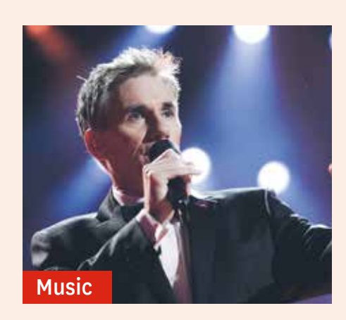
Daytime Music + Theatre Beyond the Curtain with David Hobson Friday 4 February, 10.30am & 1.30pm FAC Theatre Tickets: $20 - $22