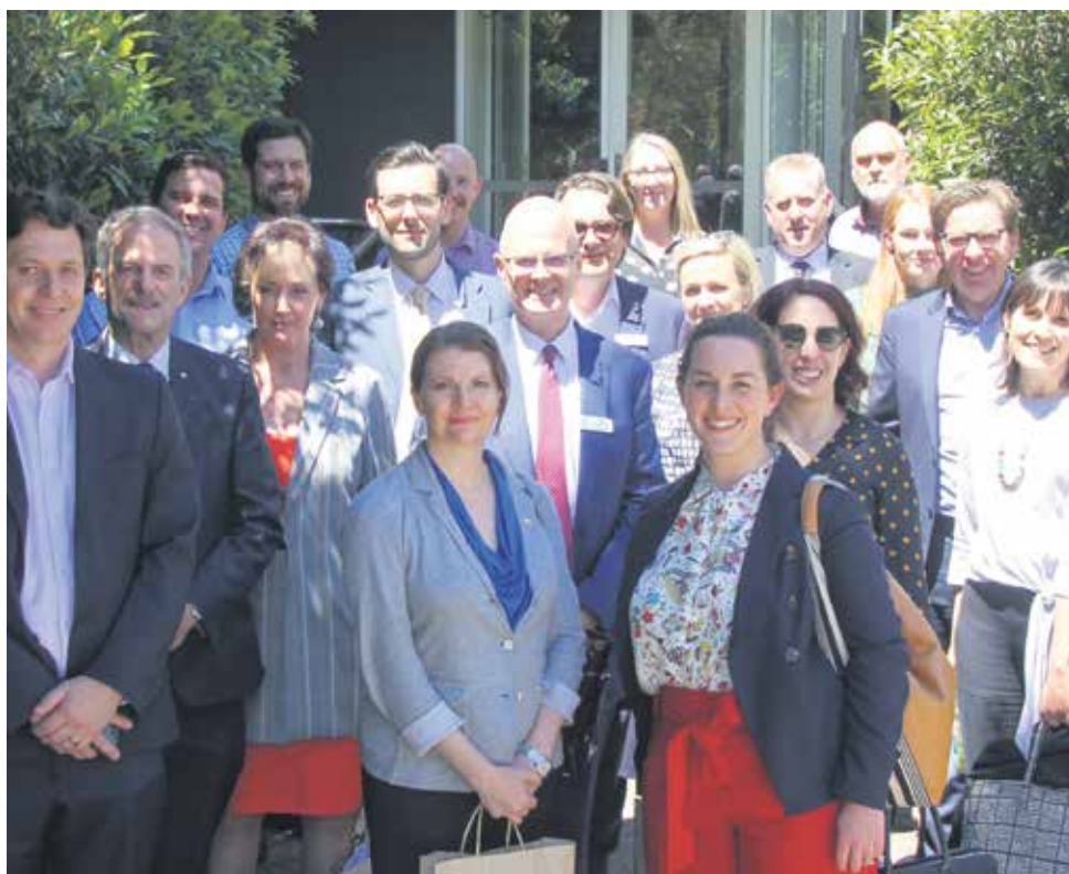
Representatives from Victorian and Federal Governments, education and industry sectors stop at Monash University Peninsula Campus, as part of Council's South East Melbourne tour.

For more information, visit: frankston.vic.gov.au/CoastGuard