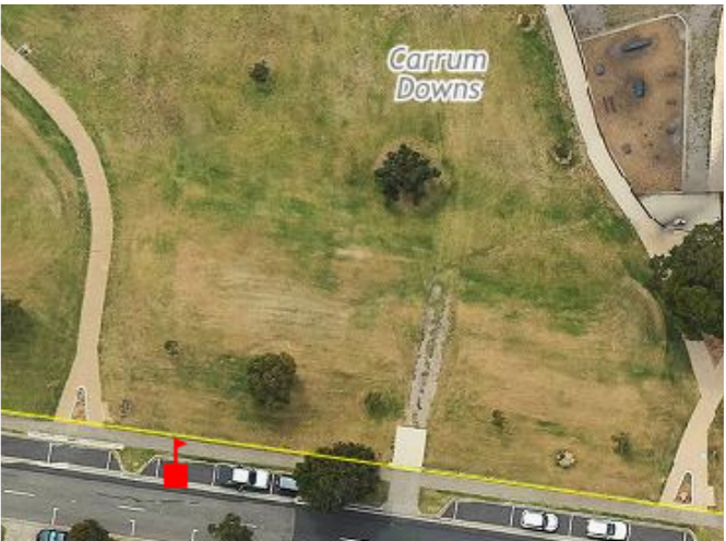
9th carpark on the left, Reserve side.