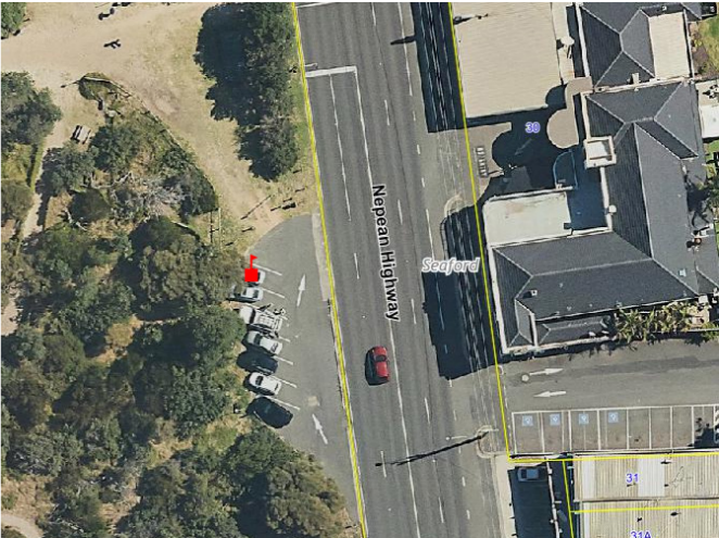
Riviera Carpark inlet, beach side, Nepean Highway.