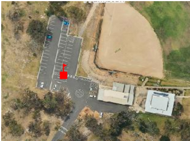
First car park in the mid-section, near walk way off Robinsons Road.