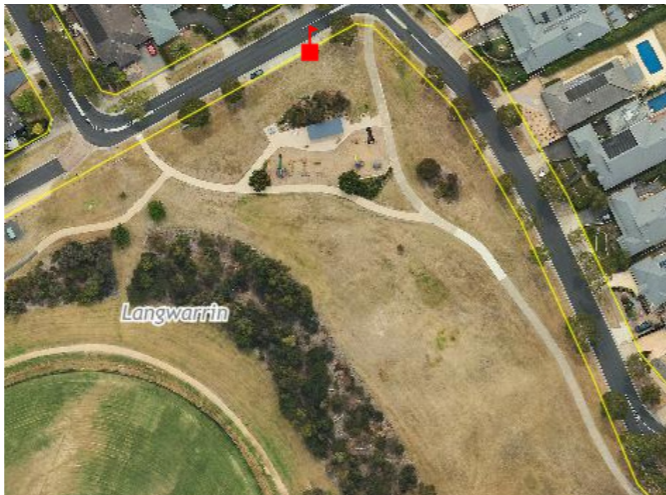
First car park near the bend of Pindara Boulevard.