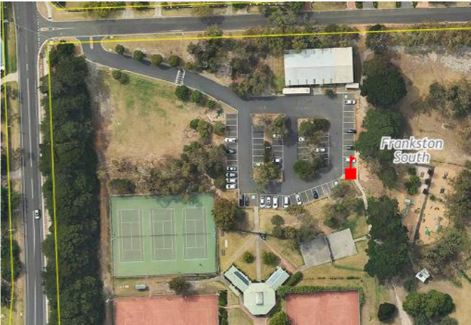
Grass area at the end of carpark, corner Somerset Road and Overport Road.