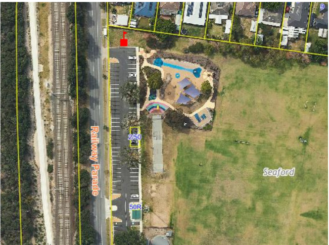
50 Railway Parade. Gravel or parking area near playground.