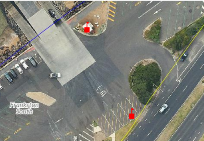
Site 1: Car park close to Nepean Highway. Site 2: Hard surface island near the boat ramp.