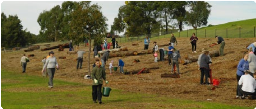
Lloyd Park during the 2014 planting