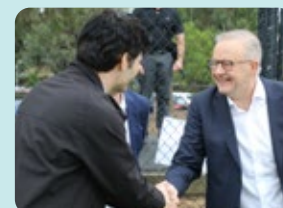
Mayor Kris Bolam JP and Prime Minister Anthony Albanese

Council will continue to advocate for additional funding from the Victorian Government to bring this project to fruition.