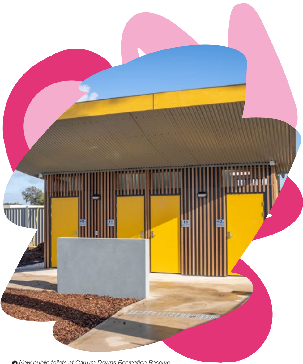
📷 New public toilets at Carrum Downs Recreation Reserve