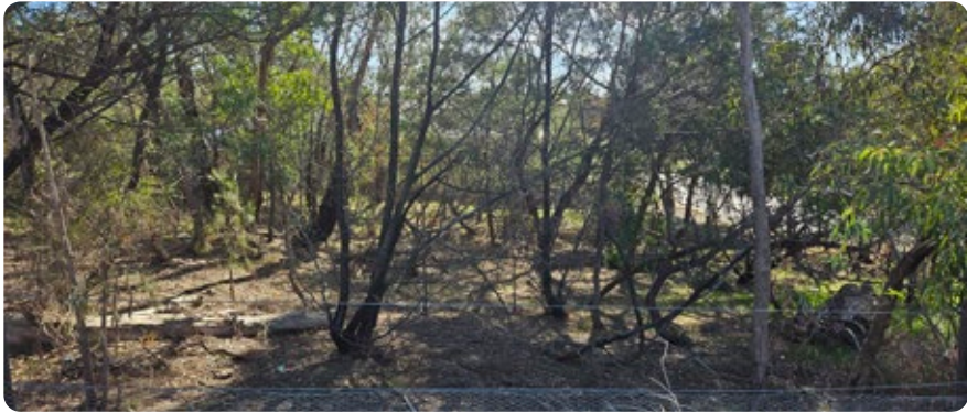
The planting site at Lloyd Park today

Help your local bushland reserve on Sunday 27 July for National Tree Day