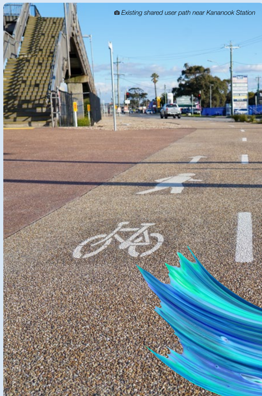
Existing shared user path near Kananook Station