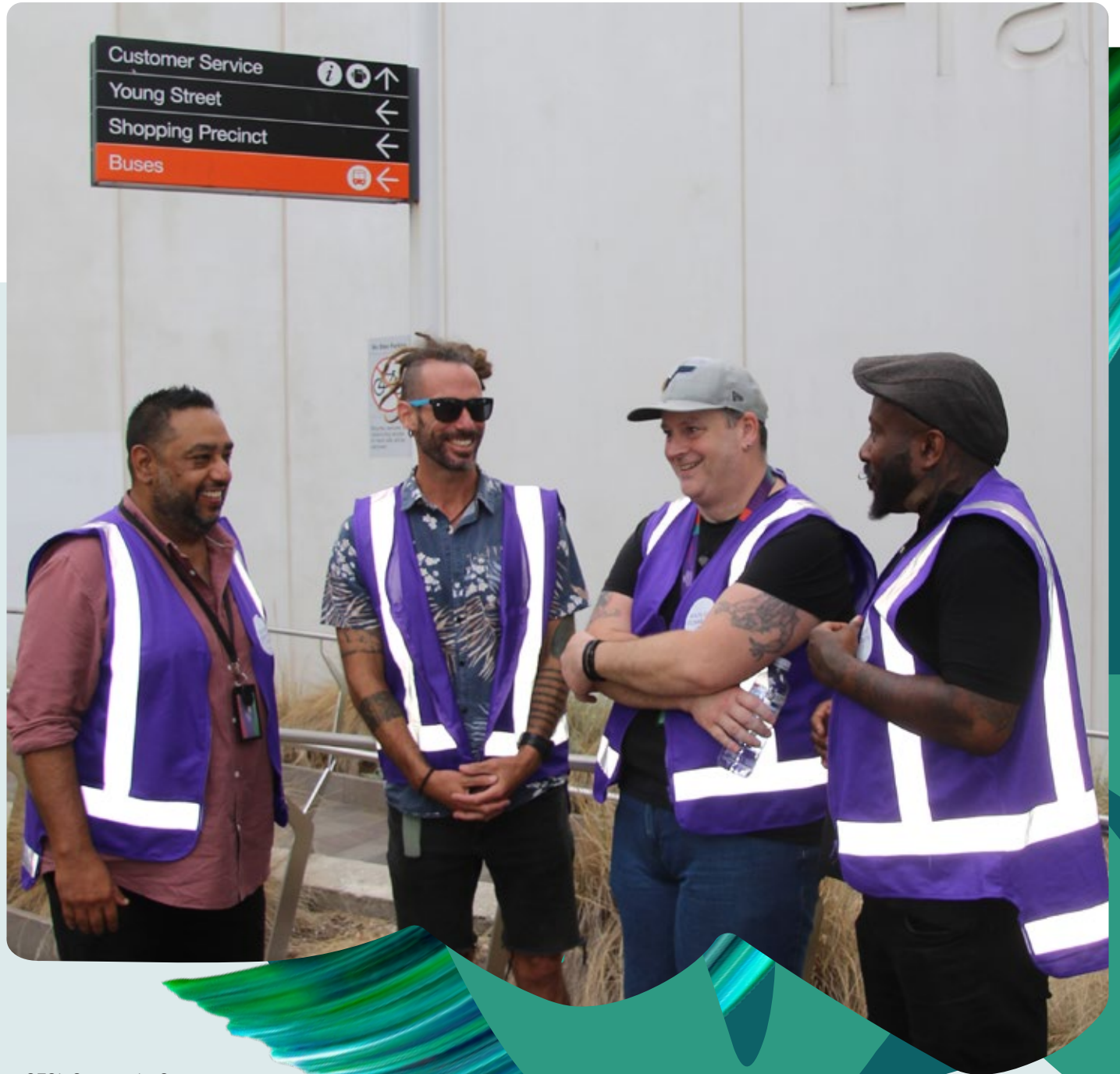
SECL Community Connectors at Frankston Station