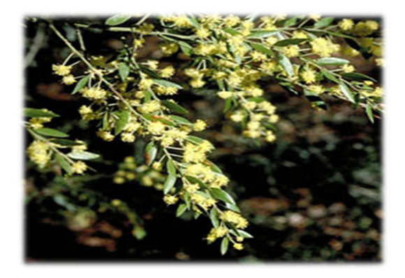
Acacia howitttii (Sticky Wattle)