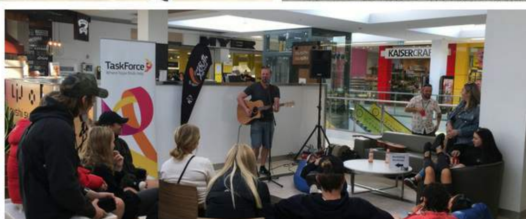
Pictured above: Youth Celebrations @ Bayside event in partnership with Bayside Shopping Centre and other local youth services to provide our young people with opportunities to engage and connect with community in a positive way.