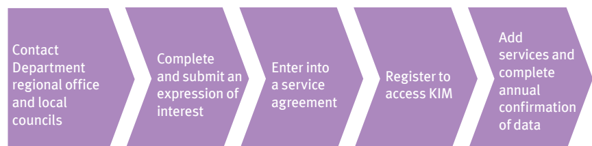
Figure 2: High level process for becoming a funded service provider

Service providers wishing to become an Early Years Management organisation see page 57.