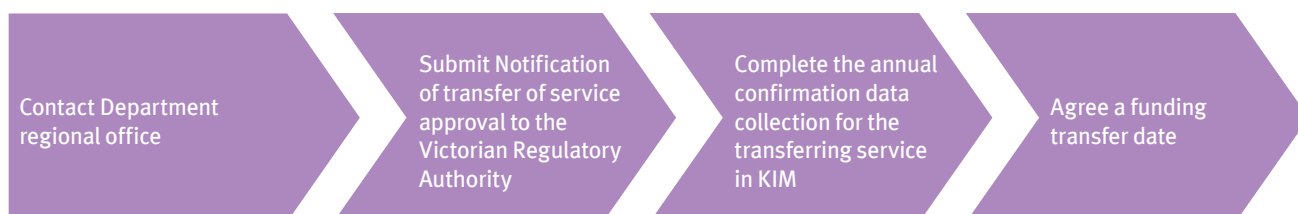
Figure 4: Transferring funding

Service providers wishing to add a service offering a funded kindergarten program that is currently being operated by another service provider should refer to How to transfer funding for a service below.