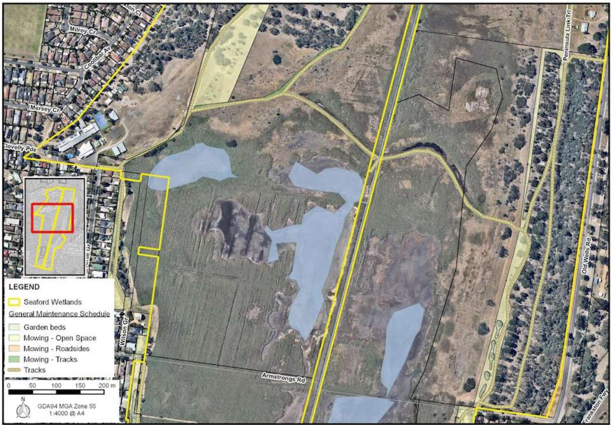
Map 2: Fire management at Seaford Wetlands Reserve