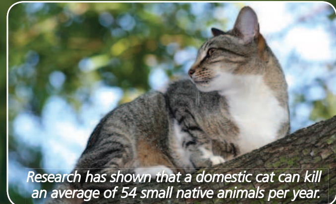
Research has shown that a domestic cat can kill an average of 54 small native animals per year.

It can be traumatic to see your cat or dog with dead native animals.