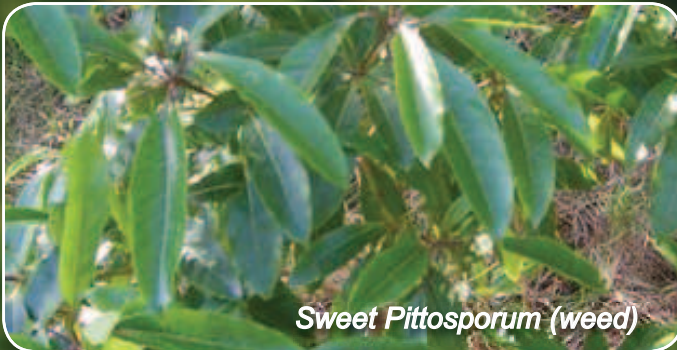
Sweet Pittosporum (weed)

Remove any invasive weed species from your garden and replace them with locally indigenous plants (plants native to this area). They require less water and will attract native birds and animals to your garden.