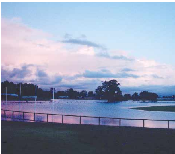
Banyan Reserve at dawn after heavy downpours.

Of those sports ovals particularly hard hit by the weather was Banyan Reserve in Carrum Downs which was left with its very own cricket pitch in the middle of an island after a torrential downpour. The ground, located in a retarding basin, was out of action for one round of matches before cricket resumed at the venue the following week. Others grounds to get their fare share of watering included