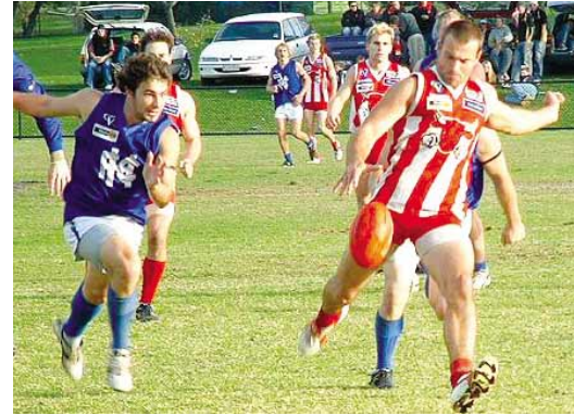
Karingal Football Club in action.